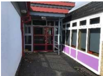
Year 2 outside door

In the mornings the doors will open at 8.50am. All the Year 2 children will enter their classrooms through the same Year 2 outside door, which is at the side of Class 5. The first 10 minutes of school is where we encourage children to read and change their Reading for Pleasure books and practice their handwriting. At 9.00am registration will begin. School will end at 3.05pm and children will exit from their outside classroom doors. Class 1 will exit their classroom via the gate in their outdoor area and Class 3 will exit via the gate in their outdoor area. Class 2 will exit their classroom from the Year 2 outside door.