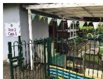
Class 3 exit door