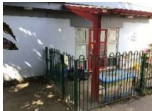
Class 1 exit door